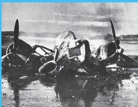
Two downed bombers on the beach. Presumably the aftermath of the Bay of Pigs Invasion in Cuba. ca.1961.