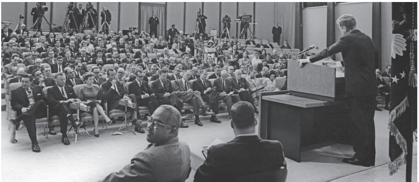
President Kennedy speaks to reporters during a press conference from a podium. Seated to the left of the podium are Associate Press Secretary, Andrew Hatcher (left, turned towards camera) and Press Secretary, Pierre Salinger. State Department Auditorium, Washington, DC. April 24, 1963.