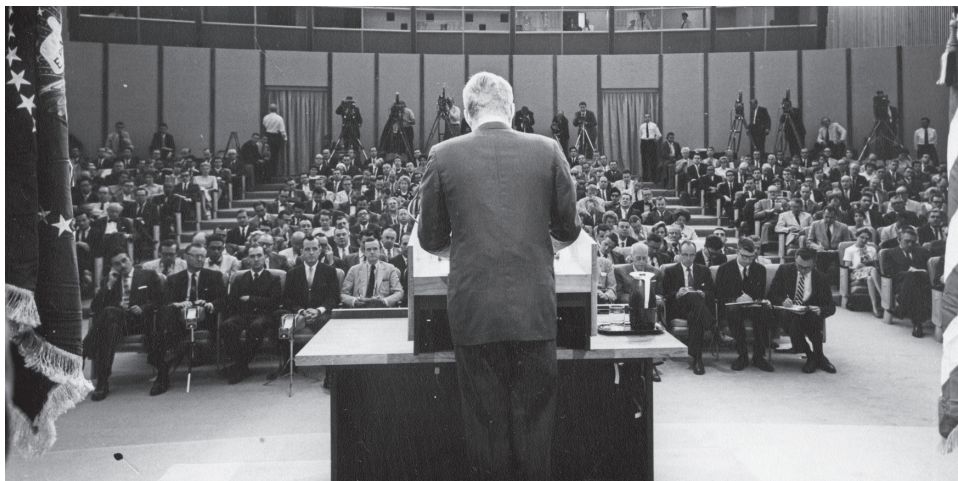
President Kennedy addresses reporters at a press conference in the State Department Auditorium, Washington, DC. August 10, 1961.