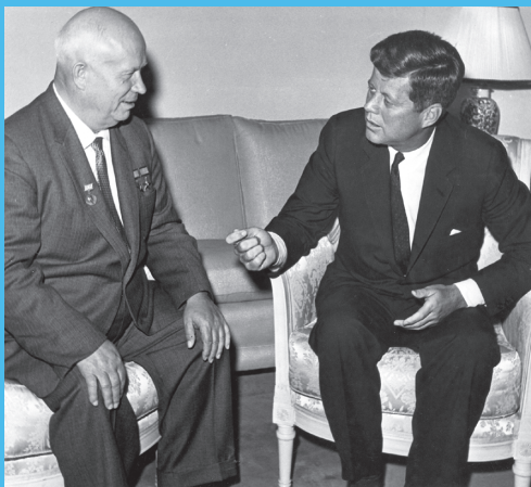
President Kennedy meets with Chairman Khrushchev at the U. S. Embassy residence, Vienna. June 3, 1961.

This edition features lesson plans that provide a deeper dive into the efforts of the first Peace Corps volunteers and a closer look at the role of JFK's press office and the hot topics covered in his press conferences, including the failed invasion of the Bay of Pigs, in what became "must-watch television". Photographs throughout this edition highlight some of the memorable moments of 1961 – from the lift-off of Freedom 7 to Kennedy's historic summit with Soviet Premier Khrushchev in Vienna, Austria. ★