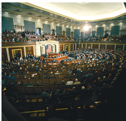
President Kennedy challenges the nation to land a man on the Moon by the end of the decade. Special Message to Congress on Urgent National Needs . May 25, 1961.