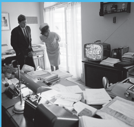
President Kennedy and Jacqueline Kennedy watch lift-off of Astronaut Alan Shepard aboard Freedom 7 on the first US manned sub-orbital flight. May 5, 1961.