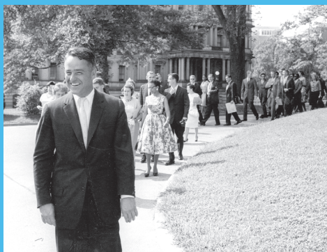
R. Sargent Shriver, Director of the Peace Corps, leads eighty Ghana and Tanganyika Peace Corps Volunteers to the White House, where President Kennedy gave them a personal send-off. August 28, 1961.